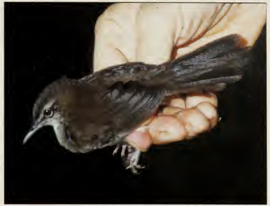
Figures 1–2. Dja River Warbler Bradypterus grandis , Nki Faunal Reserve, southeast Cameroon, January 1998

(two being observation platforms for elephants and one an elephant track leading to the bai ) produced four, two and two singing birds, all of which were probably different individuals, as the three localities are well separated. Dowsett-Lemaire & Dowsett 4 mention 'at least six singing birds holding territory in Rhynchospora marsh, in c6 ha' and 'a pair holding a territory in a 1-ha patch of Rhynchospora corymbosa ' for Nki. From these figures, Langoué bai could harbour 20 pairs within its c20 ha. As there are many bais in the region, it is probable that the total population exceeds 1,000 mature individuals.